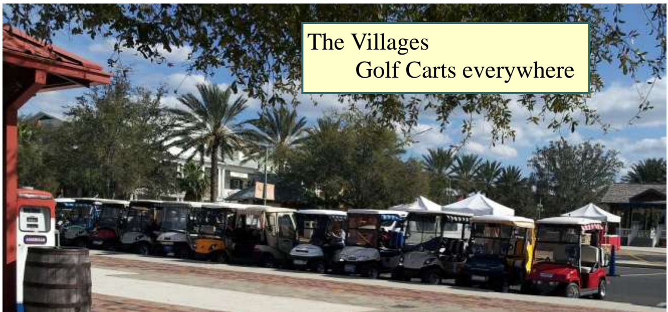
The Villages Golf Carts everywhere